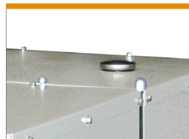
TANK REFILLING POINT BOCCHETTONE SERBATOIO