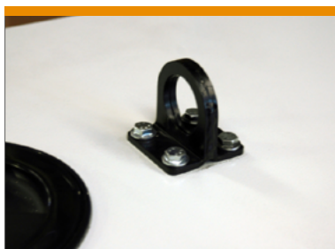
LIFTING HOOK GANCIO DI SOLLEVAMENTO