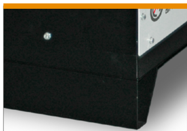
SELF SUPPORTING FRAME TELAIO AUTOPORTANTE